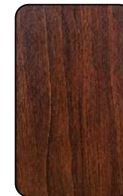
DARK NATIONAL WALNUT