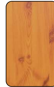
LIGHT TOASTED PINE