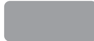
WINDOW GRAY ZPS-008