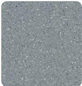
LIGHT GRAY NATURAL CONCRETE