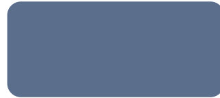
BRILLIANT BLUE ZPS-015