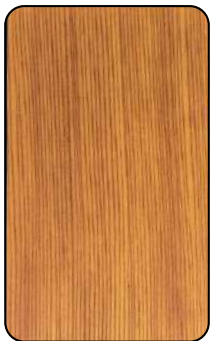
LIGHT TOASTED FIR