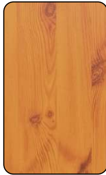
LIGHT TOASTED PINE