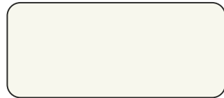
BONE WHITE ZPS-002