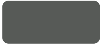
DARK UMBRA ZPS-013