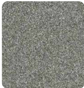
DARK GRAY NATURAL CONCRETE