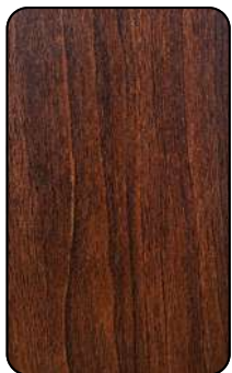
DARK NATIONAL WALNUT